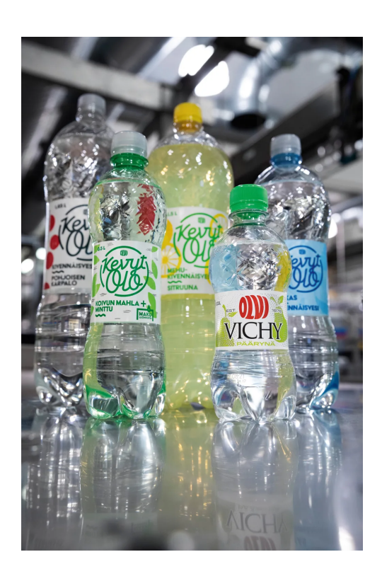
↑ Each and every one of Olvi's 30 bottle formats has been created with the help of KHS' Bottles & Shapes™ experts.

Since 2010 Gunnar Bartel and his team have performed 18 conversions in the packaging and palletizing area. These include replacing the bottle heads with KUKA robot controllers, for example, or substituting an auxiliary robot to prepare layer pads. Staging areas for various packing heads have been retrofitted to minimize changeover times. What's more, for the multitude of bottle shapes of varying diameter suitable packing heads such as multigrippers have been supplied to enable all conceivable types of pack to be palletized.