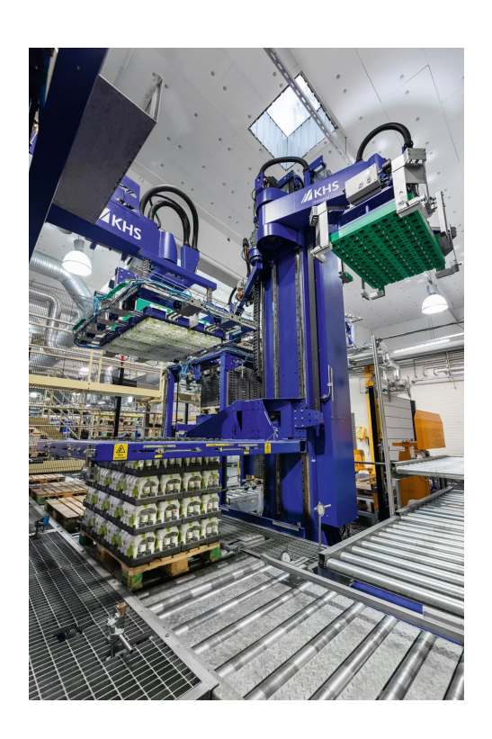
↑ The 18 conversions KHS has made to the packaging and palletizing area since 2010 also include replacing the bottle heads with KUKA robot controllers.

When in 1878 the brewery that now goes under the name of Olvi was established in the little town of Iisalmi, idyllically situated on Lake Porovesi, there were 78 brewhouses scattered throughout Finland. One hundred and forty-three years later, Olvi is the only brewery to have remained independent and under Finnish ownership. Not surprisingly, then, the company's history is shaped by the successful development, production and marketing of a vast number of different beers and soft drinks that have triggered rapid growth − especially since the company went public in 1987. Today, the Olvi Group is represented by its products and a number of production facilities not just in Finland but also in the three Baltic states of Estonia, Latvia and Lithuania and in Belarus. All told, in 2019 the group achieved a turnover of €409 million with an output of 718 million liters, with about 41% of this yielded on the home market.